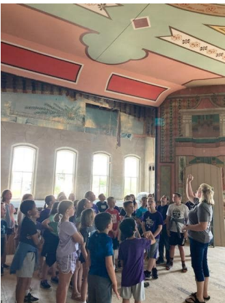
The 3rd & 4th grade students at Fort Recovery took tours of the opera house and were able to see first hand what they've learned in 3rd grade music about Fay Morvilius and opera houses in the late 19th/early 20th centuries!