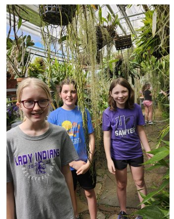
Fifth graders were able to explore the rainforest in the greenhouse at Ball State University.